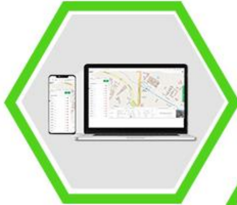
Fleet management capabilities

Decoupling bikes from batteries for affordable pricing