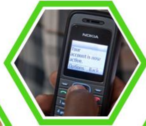
Pay-as-you-go energy purchase via mobile money

Franchise system for IoT-enabled battery distribution