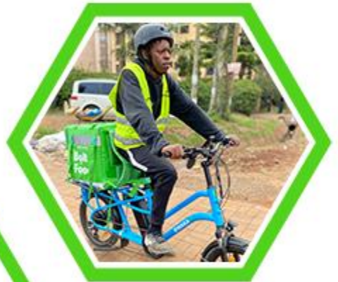
Development of a delivery service platform connecting green riders with SMEs