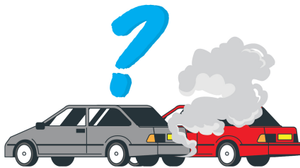
Quality and safety of used vehicles