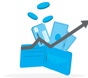
Costs to operate used vehicles