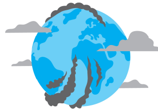
Pollutant and climate emissions of used vehicles