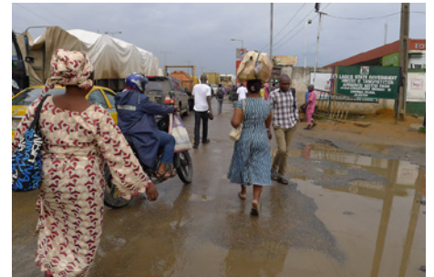
Lack of storm water drainage