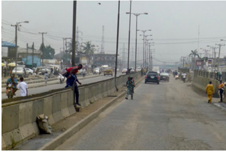
Lack of pedestrian crossings