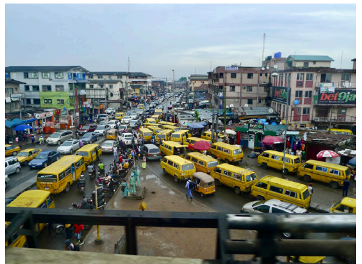
Lagos’s landscape is dominated by a host of users and vehicles, including pedestrians, cyclists, okadas (motorcycle taxis), kekes (three-wheelers), cars, danfos (minibuses), and heavy trucks.

Lagos residents rely heavily on informal paratransit modes such as danfos as well as taxi services such as kekes (three-wheelers) and okadas (motorcycle taxis). The lack of usable, dedicated pedestrian spaces means that pedestrians share the carriageway with fast-moving vehicles. High motor vehicle speeds along with the lack of dedicated spaces compromise NMT user safety. As vehicle speeds increase over 30 km/h, the chance of NMT fatalities increases dramatically. Thus, NMT users are by far the most exposed and vulnerable group