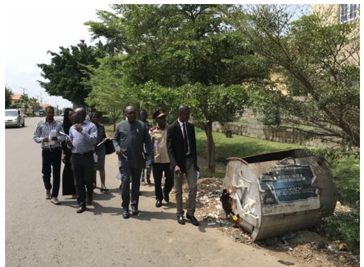
Stakeholders taking part in a site visits in urban areas in Nigeria

The Oct 2018 workshop was organised to present the draft Lagos NMT Policy and gather feedback from stakeholders. The event brought together representatives from government, elected bodies, academia, the private sector and civil society organisations. Participants gave their consent to move forward with adoption of the NMT Policy. As the next step, the draft Policy will be sent to the Executive Council for consideration and approval. Laws and regulations will be derived from the policy document by legal representatives of MOT and Ministry of Justice (MOJ). The Policy will then go to the House of Assembly for final review and approval.