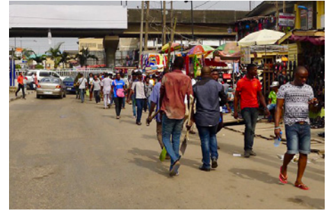
Streets lack separate space for walking