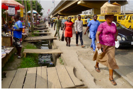
Risky open drains