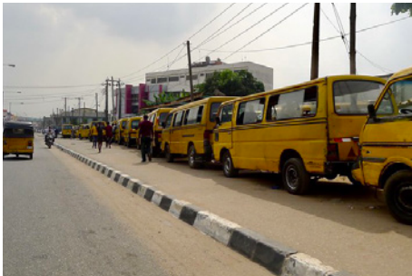
Poor parking management