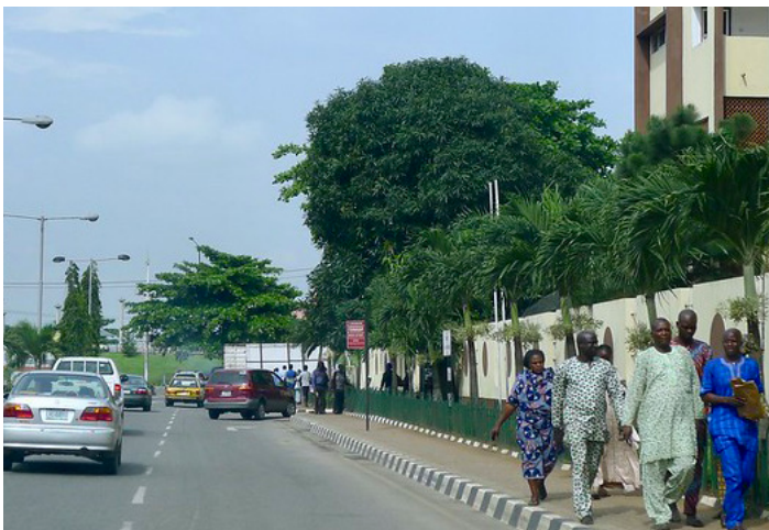
A footpath in Lagos

The Lagos State and Federal NMT Policies outline a number of initiatives to develop transport systems and urban plans that are socially inclusive and environmentally friendly. These include: