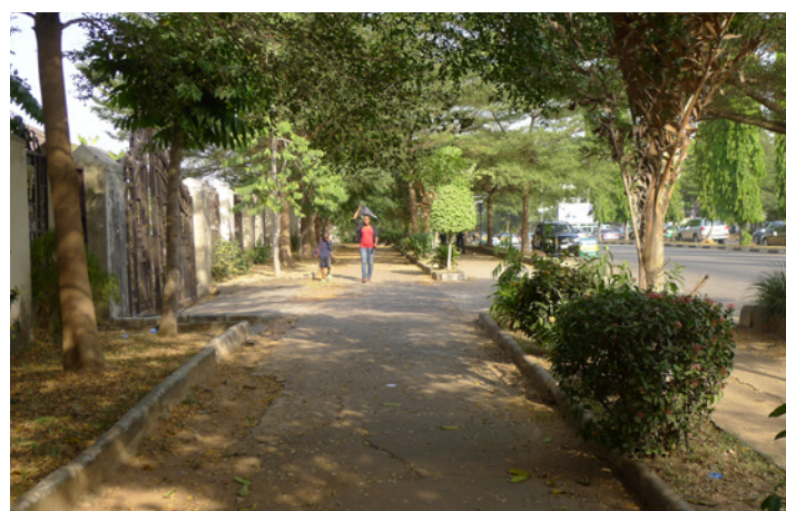
A footpath in Abuja