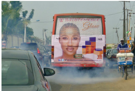
High levels of pollution