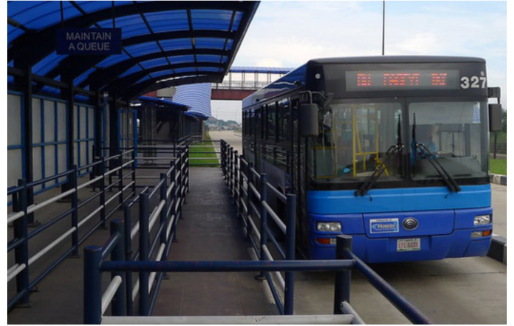
A BRT station in Lagos