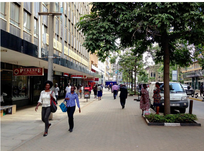
An early NMT improvement project in Nairobi: Footpath widening along Mama Ngina St