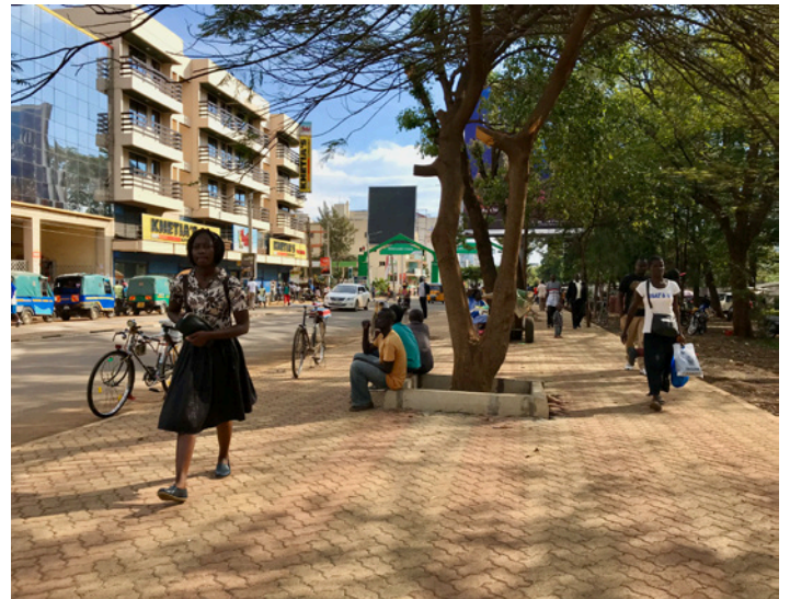
New footpath in Kisumu