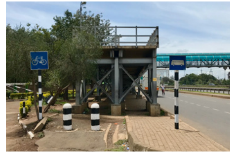
NMT access obstructed by footbridges