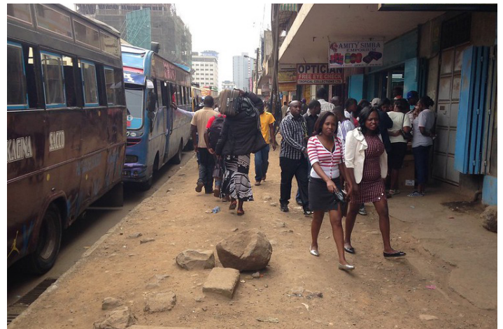
Many streets in Nairobi lack pedestrian walkways

The Kenya National Highways Authority (KeNHA) and Kenya Urban Roads Authority (KURA) continue to invest in billions of shillings in the construction of bypasses, missing links, and flyovers in Nairobi and other urban areas. These projects often come at the expense of NMT users, as the new roads are hard to cross and lack accessible walkways. In many cases,