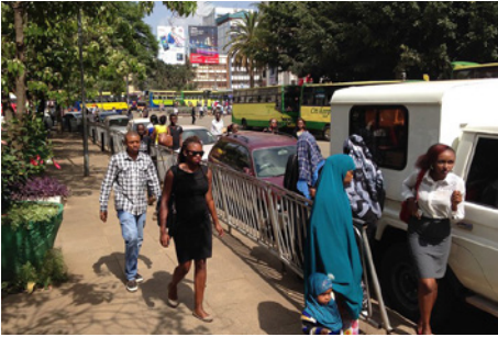
Pedestrian movement blocked by fences