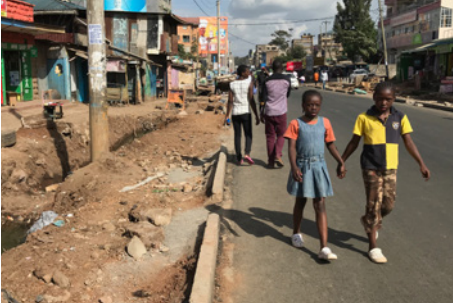
Lack of footpaths on many streets