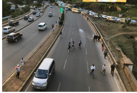
Major corridors designed as highways rather than urban streets