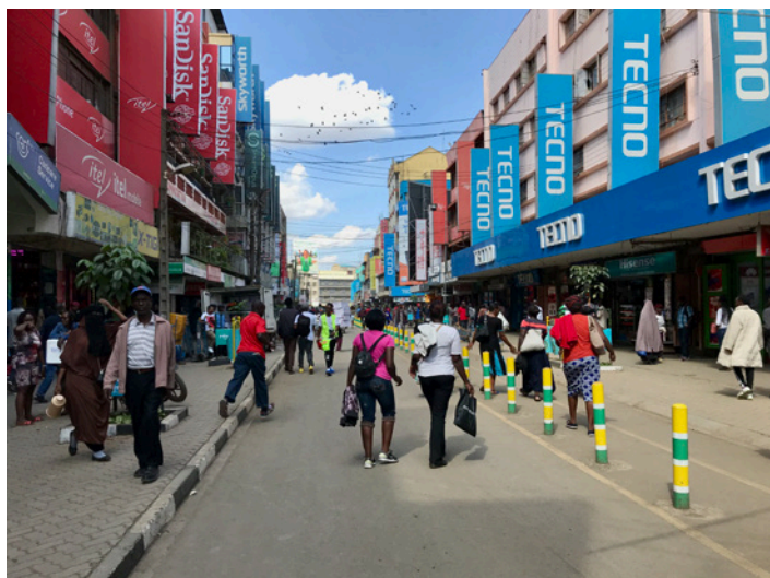
Nairobi's Luthuli Ave