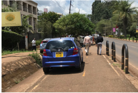
Parking encroachments on NMT spaces