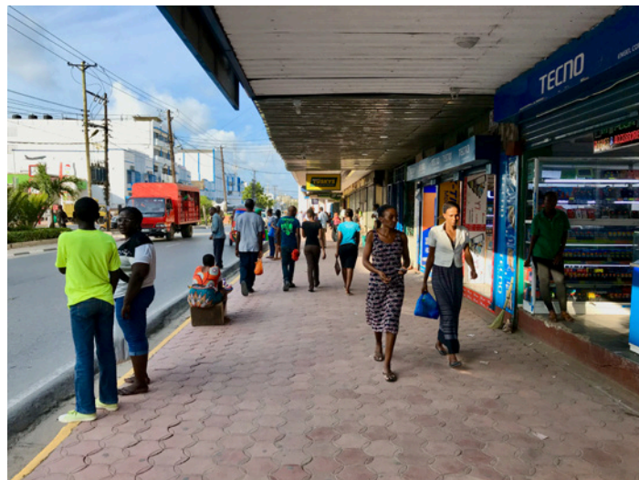
A refurbished walkway in Mombasa

Several counties are taking a leadership role in the provision of NMT facilities. Kisumu, Kenya's third largest city, is developing 1.4 km of high-quality walkways and protected cycle lanes with