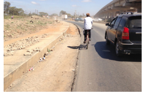
Unusable cycle lanes