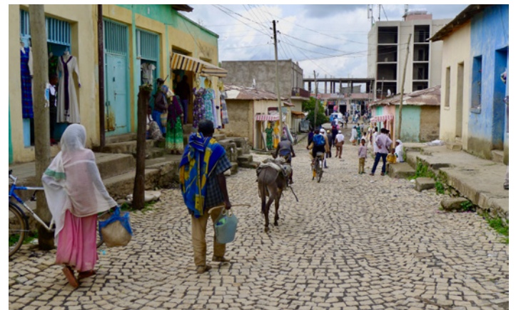
Shared street in Aksum

Many footpaths are not wide enough for pedestrian volumes and the available pedestrian network is incomplete and