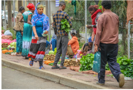
Absence of vending management systems