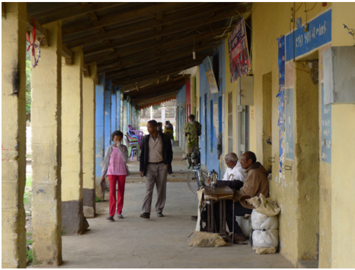
Covered walkway in Aksum