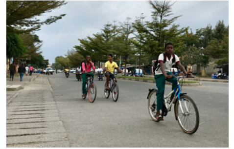
Lack of cycle facilities