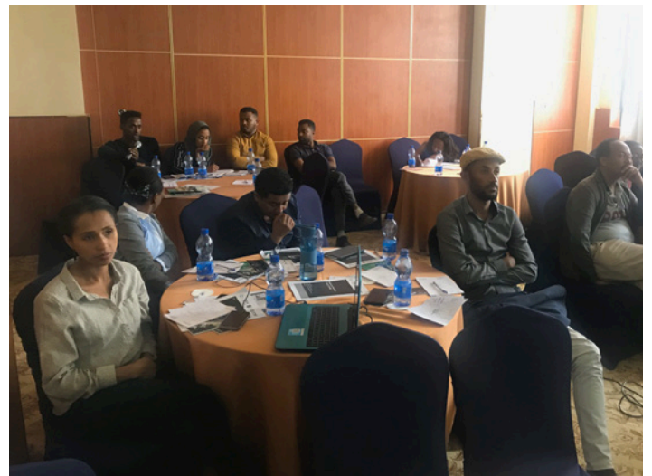
NMT Strategy stakeholder workshop