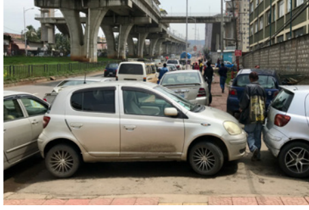
Parked vehicles obstruct footpaths