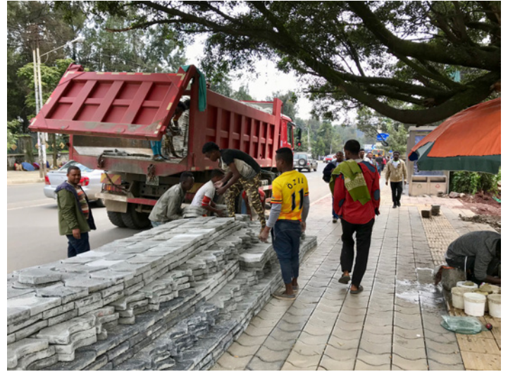
Footpath construction in Addis Ababa