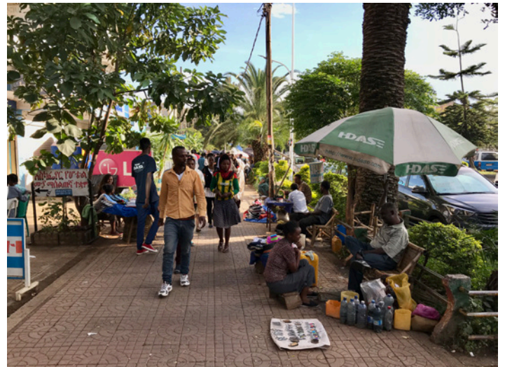
Footpath in Bahir Dar