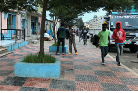
Basic footpaths on many streets