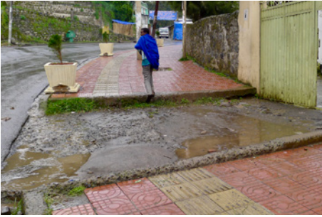
Lack of universal access