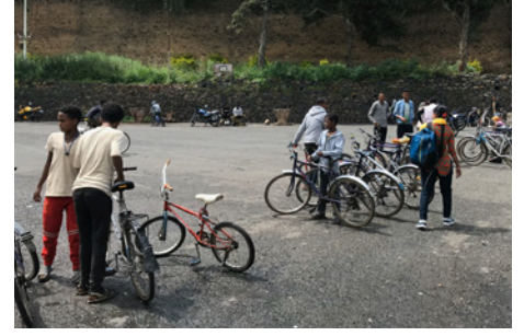
Widespread presence of cycle rentals